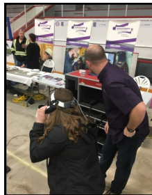
Above: Student interacting with virtual Autobody simulation tool.