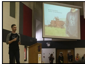
Above: Entrepreneurial focused Keynote Address with PRAIRIE PROUD