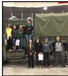
Below: Canadian Forces reps share info with students