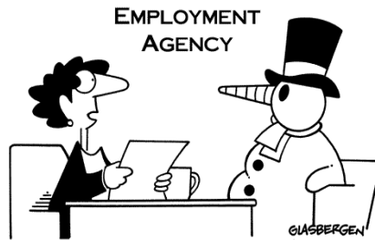
"Right now we have openings for a beach lifeguard, greenhouse gardener, and sauna manager."